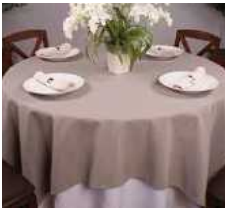
TABLE SKIRTING AVAILABLE

PLEASE NOTE: 10% +/- policy applies to banquet cloths and rounds in standard colors and to all custom sizes and are not returnable.