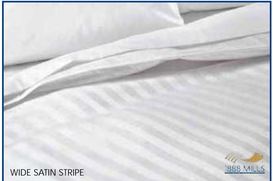
WIDE SATIN STRIPE